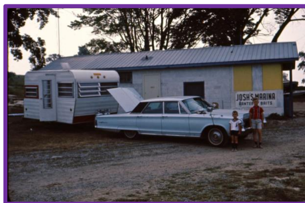
My brothers with the car our family drove to Expo 67

Many cars manufactured in the 1960s are no longer being made. In my novel I used car models that I remembered my family owning in the 60s like the Envoy, the Studebaker, a Chrysler, the Dodge Dart, and the Mercury Marquis. Of course, seat belts, air conditioning and GPS travel assistance weren't available in the 60s which made car trips very different than they are now.